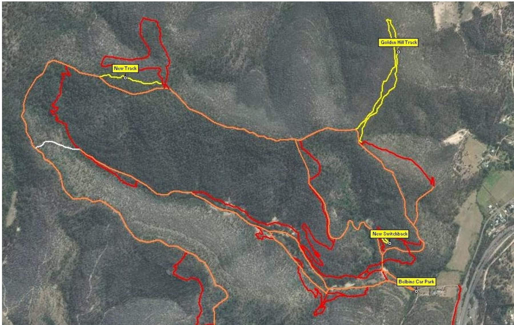
Tracks from Belbin Rd